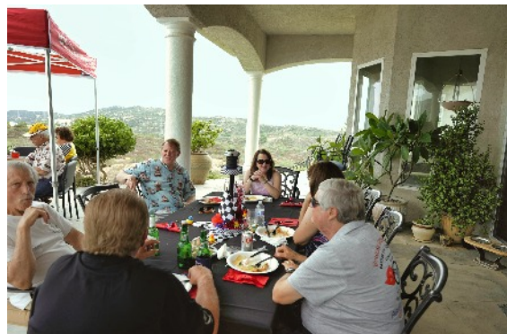
Past President's Picnic, August 14th