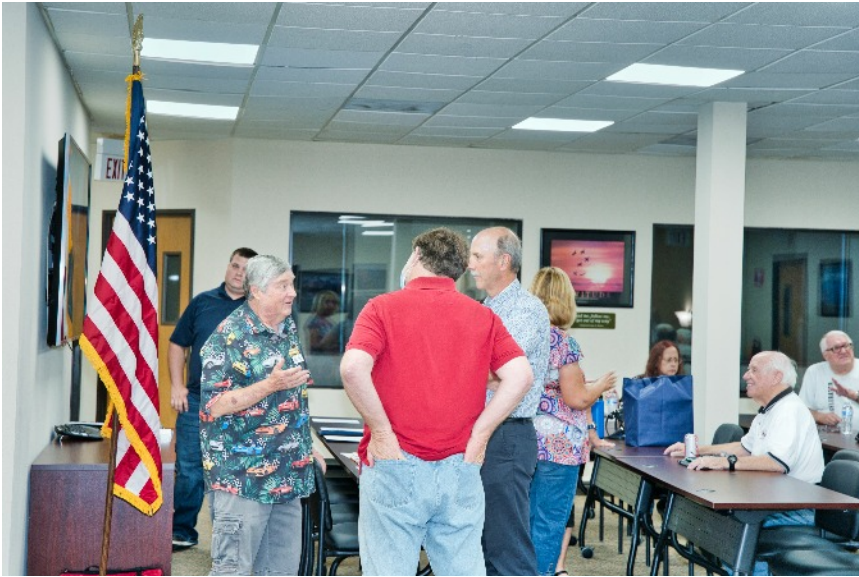
Snapshot of a Meeting