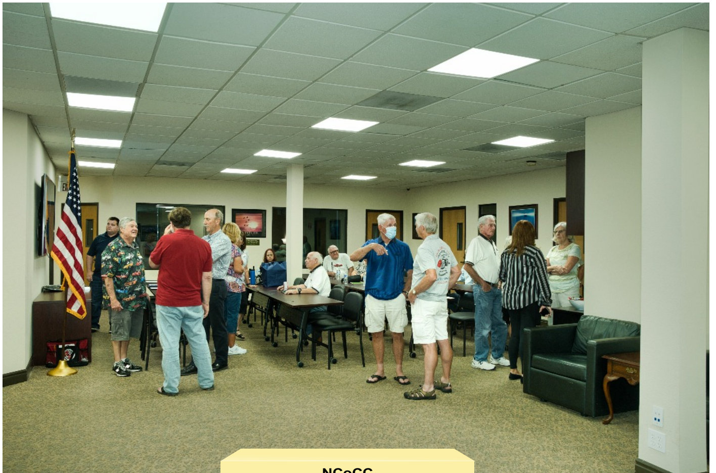
NCoCC August Business Meeting

What's Inside: President's Corner Board of Directors Club Events Calendar About Our Club