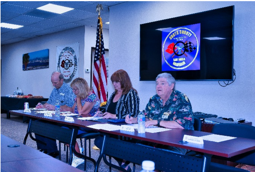
Snapshots of a Meeting